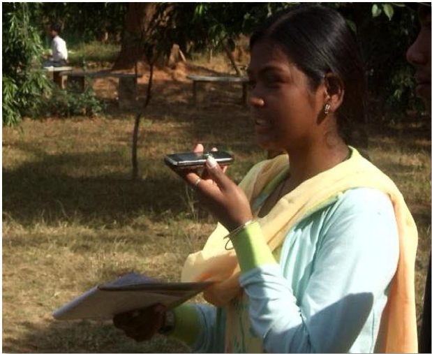
Citizen Journalist in Chhattisgarh